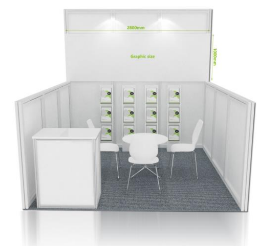
*Design layout for reference only